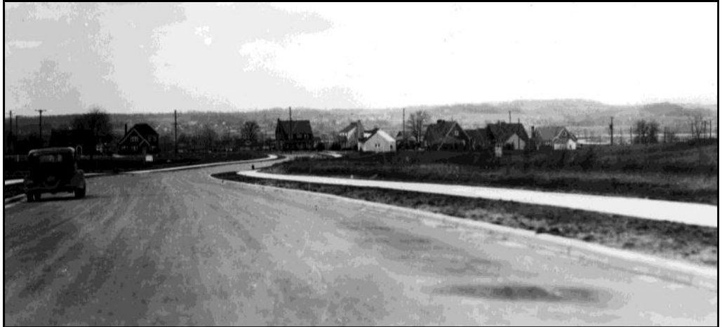
Marywood Avenue, looking east towards Plainfield, May 1939.

In 1924, Charles donated land to the city for a municipal golf